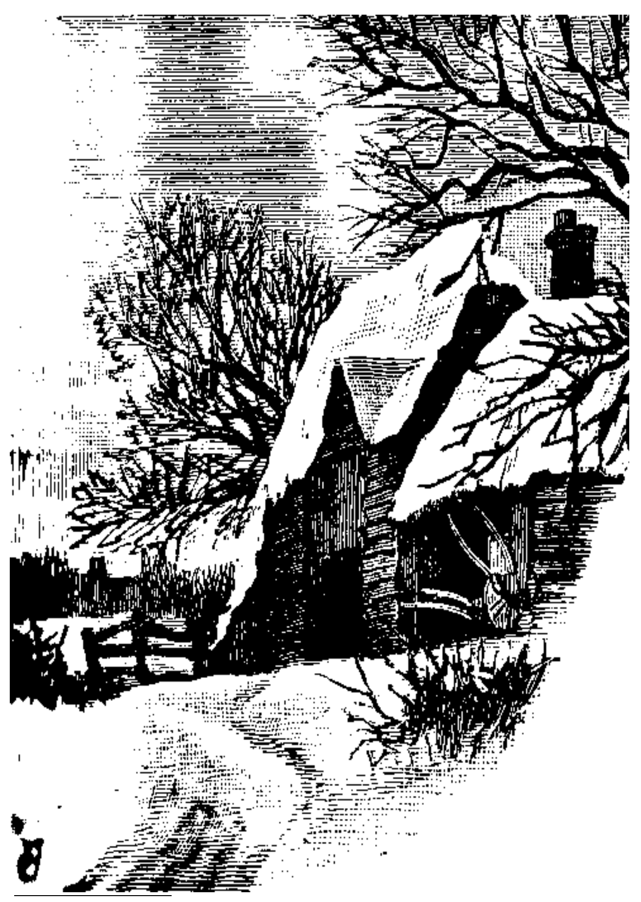
1 Adapted from an activity on the Mothers' Companion flashdrive. See <u>https://motherscompanion.weebly.com/</u> for sample pages and to purchase.